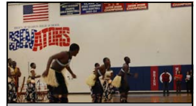
Abantu Mu Buntu performs