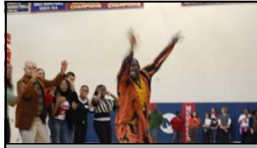
Students/staff perform with Abantu Mu Buntue

Abantu Mu Buntu, a troupe of dancers, singers and drummers from Uganda as part of their three-week tour of the U.S., perform at the Center for Global Studies. Organized by Creative Connections, they bring talented young performers from their partner countries to perform in the USA.